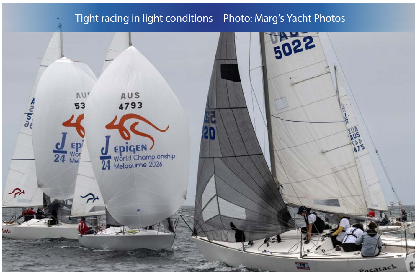
Tight racing in light conditions – Photo: Marg's Yacht Photos

Race 5 finally delivered a steady breeze, allowing a fairer contest. Checkmate started strongly at the pin, crossing John Crawford's Innamincka at the first cross, with Ace recovering from an OCS. They finished in that order— Checkmate , Innamincka , Ace —in a classic J/24 three-way duel. In the final race, podium positions were wide open, with Stamped Urgent , Innamincka , Ace and Tinto all in contention. Checkmate , already secure at the top after a string of consistent results, sealed the regatta with another win; Innamincka took second, Stamped Urgent third. After countback, three boats tied on 17 points— Tinto claimed second overall, Ace third and Stamped Urgent fourth, just one point ahead of Innamincka .