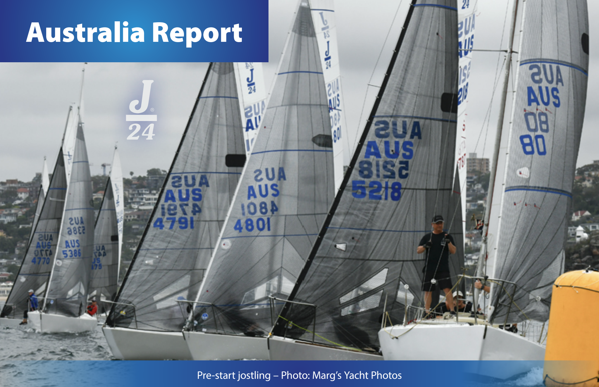
Pre-start jostling