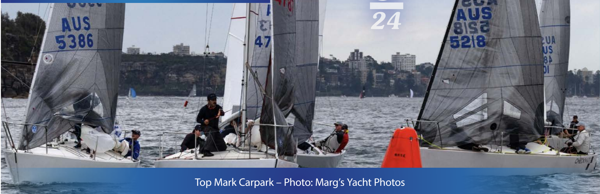
Top Mark Carpark

Day 2 Sunday dawned overcast again, with fickle breezes that tested patience and tactics. The top mark was set near South Head, where the wind split the fleet dramatically—boats on the port layline found fresh offshore breeze, while those only metres away stalled in a hole. Ace , sailing left, rounded just behind Jack Felsenthal's Sailpac (a rapidly improving youth team from Pacific Sailing School), while Checkmate recovered from the right-hand side to challenge downwind. Race Management shortened the course, and Ace took the win ahead of Checkmate and Sailpac , with the next three boats finishing within 20 seconds. Race 4 brought more light-air drama. Ace again led early, with Birubi close behind, but both were becalmed 50 metres from the bottom mark as new breeze filled from the middle of the course. Tinto capitalised brilliantly, surging ahead to take the win from Checkmate and Sailpac .