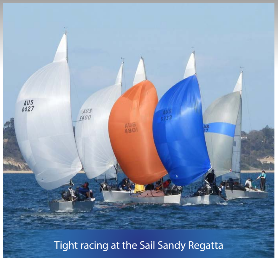
Tight racing at the Sail Sandy Regatta

Our season start has been a mixture of light and heavy winds, which is typical for this time of year. This was evident when the Thursday night social race, which included 10 J/24s in a fleet of 60, was hit with two cyclonic wind events—the first with gusts of 47 knots, the second 10 minutes apart at officially recorded 58 knots.